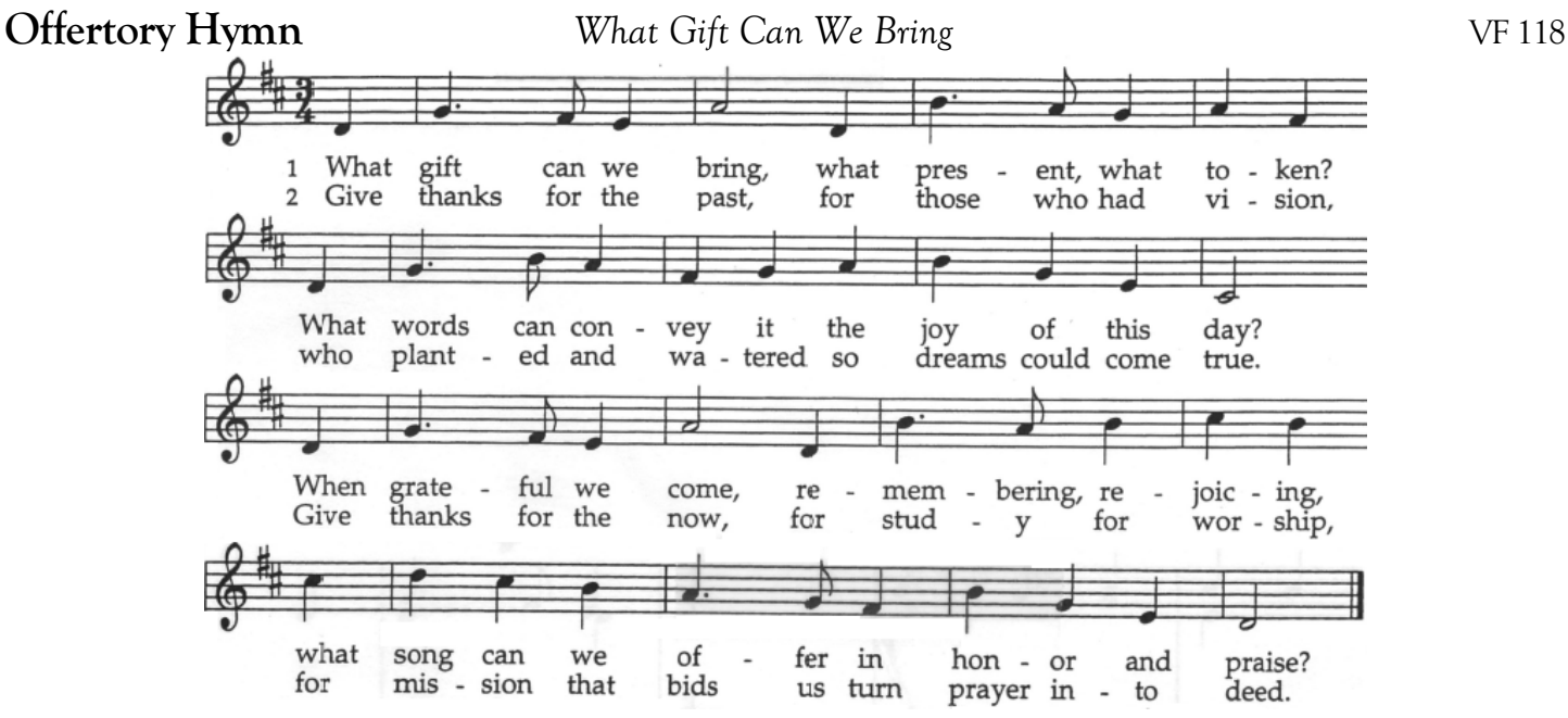
Please stand as you are able.